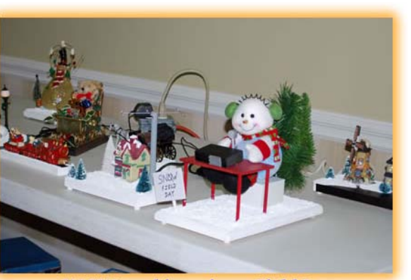
SNØW working winter Field Day