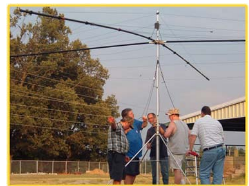
Cabling Spiderbeam for phone station

Construction of the antenna arrays began on Friday